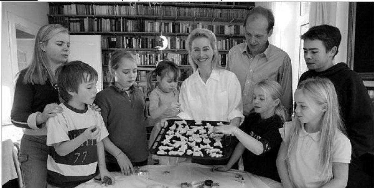
Figure #5: Minister von der Leyen poses with her family

Found in "Quoth the Raven: I Bake Cookies, too." New York Times (23/04/2006)